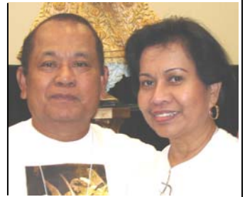
El Shaddai Catholic Charismatic Group of St. Stephen, Washington, DC Mid Atlantic Regional Coordinator